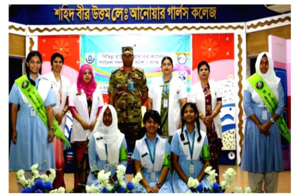
Panel members of 2023