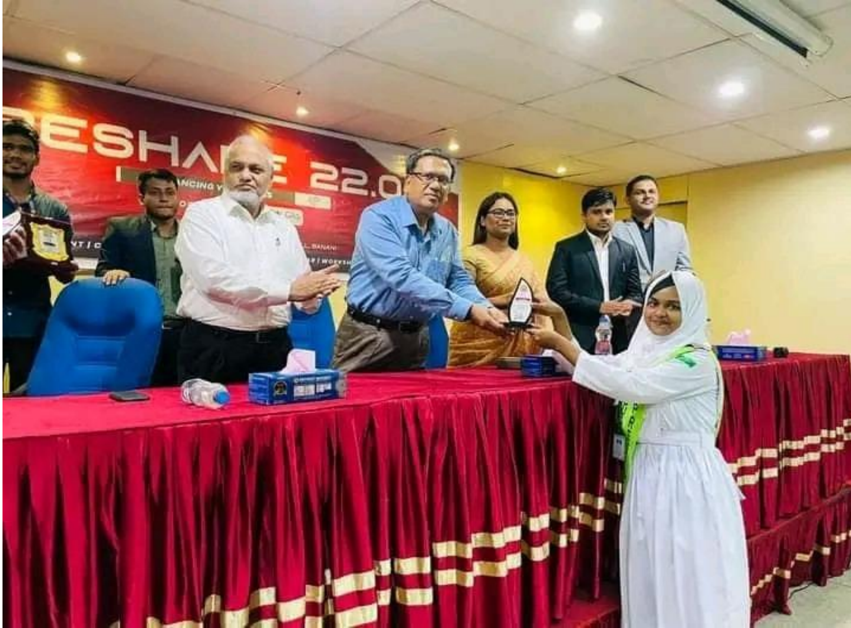
The President of our Club was receiving crest for her great contribution In Southeast University Business Innovation Forum 2022