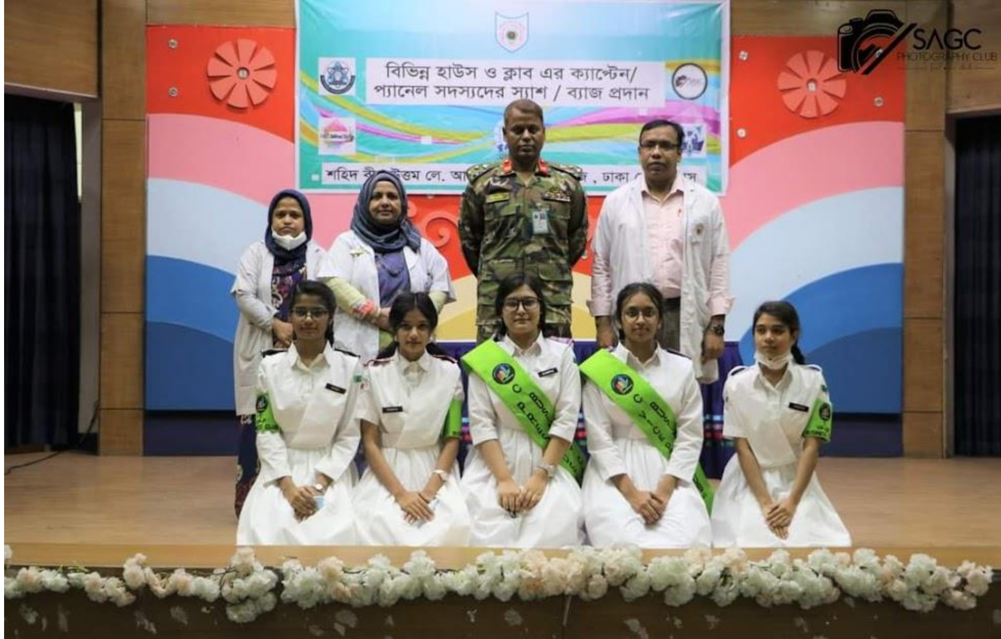
The founder leaders of the SAGC Business Club