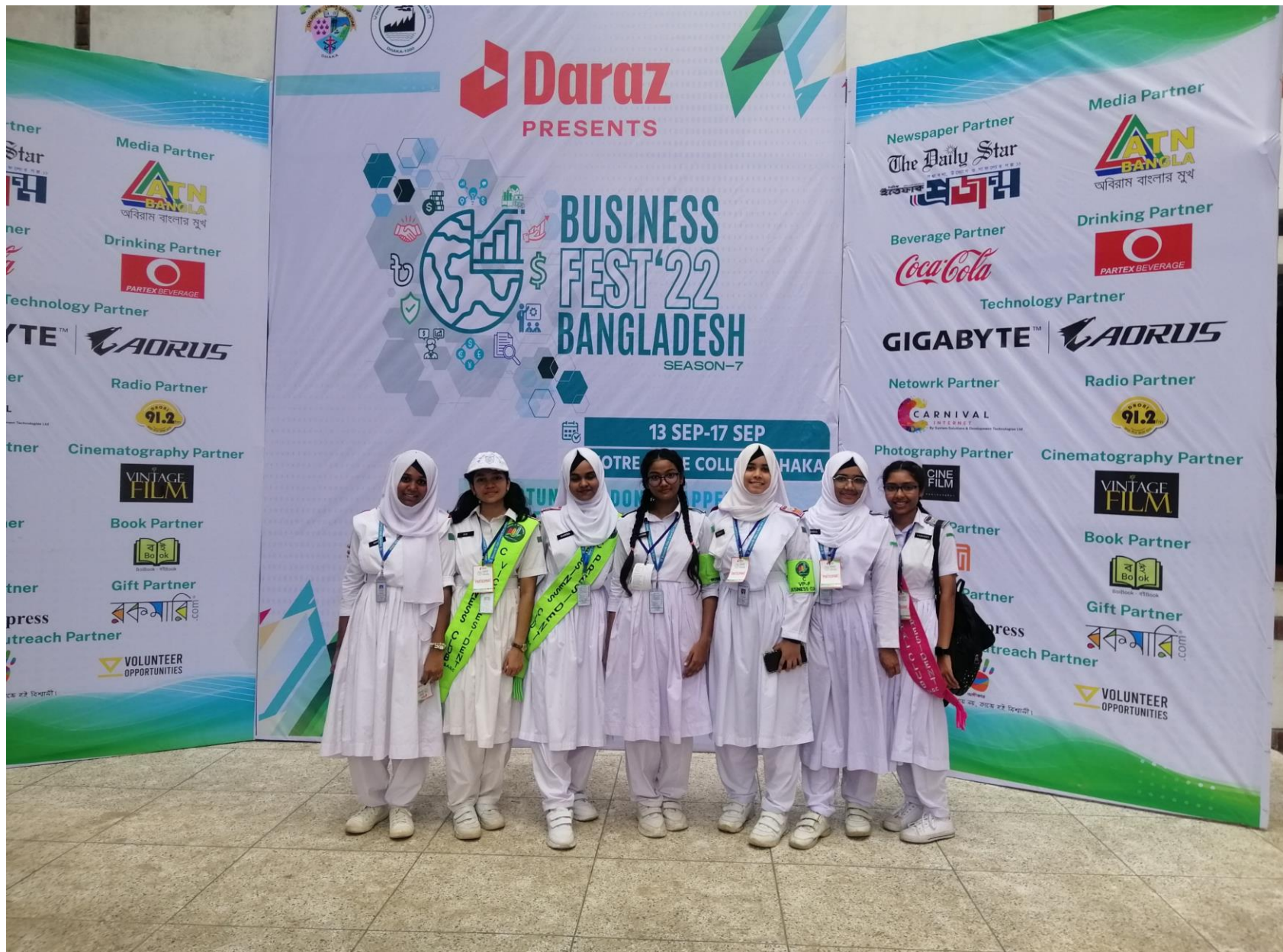
Business Fest Bangladesh 22 organized by Notre Dame Business Club (16 - 17 September ,2022)