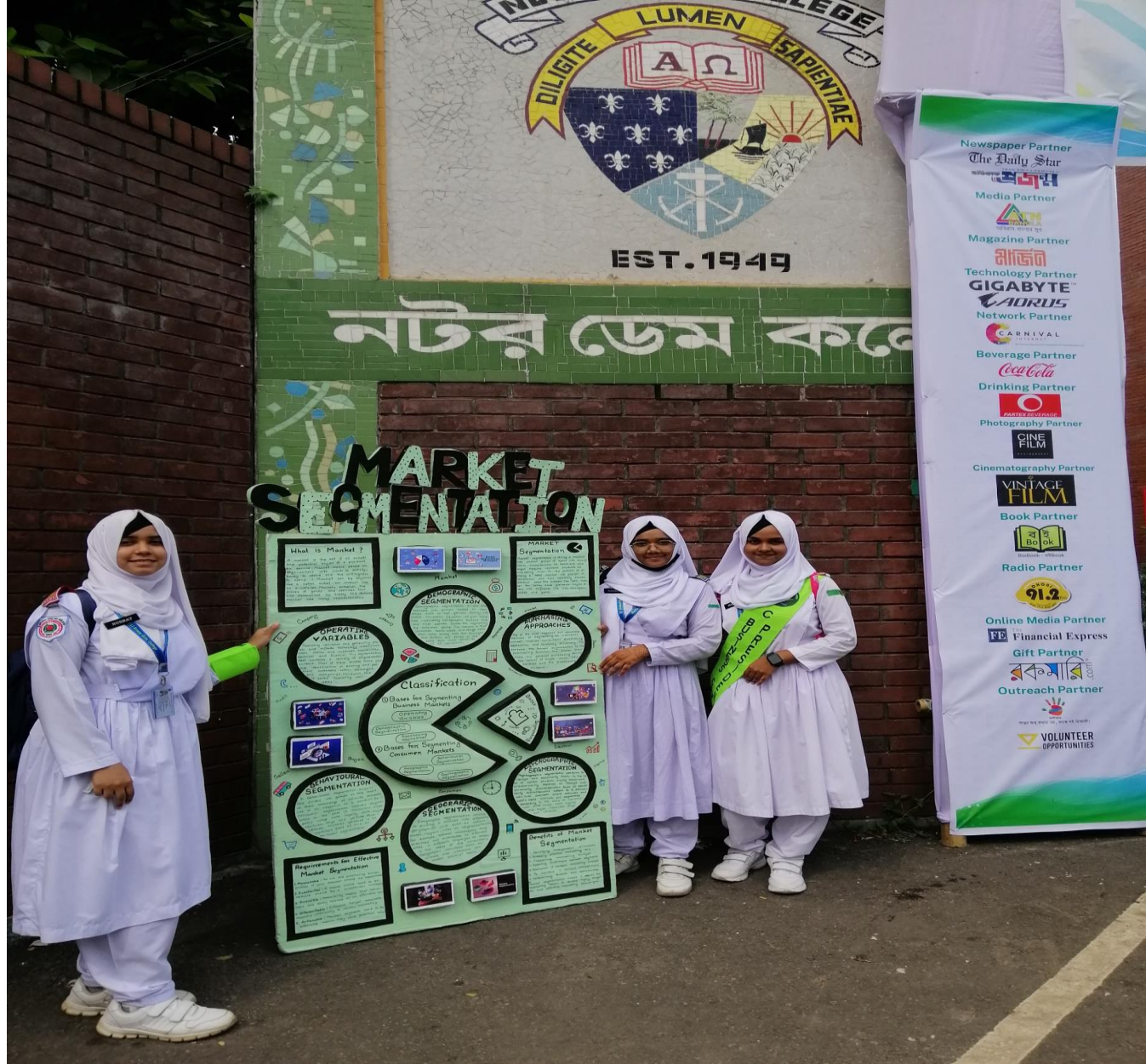
Business Fest Bangladesh 22 organized by Notre Dame Business Club (16 - 17 September ,2022)