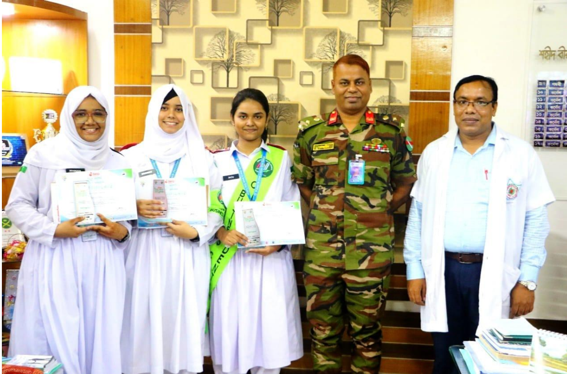
A memorable moment for our team, standing next to our Honorable Principle of SAGC with one of our greatest achievements.