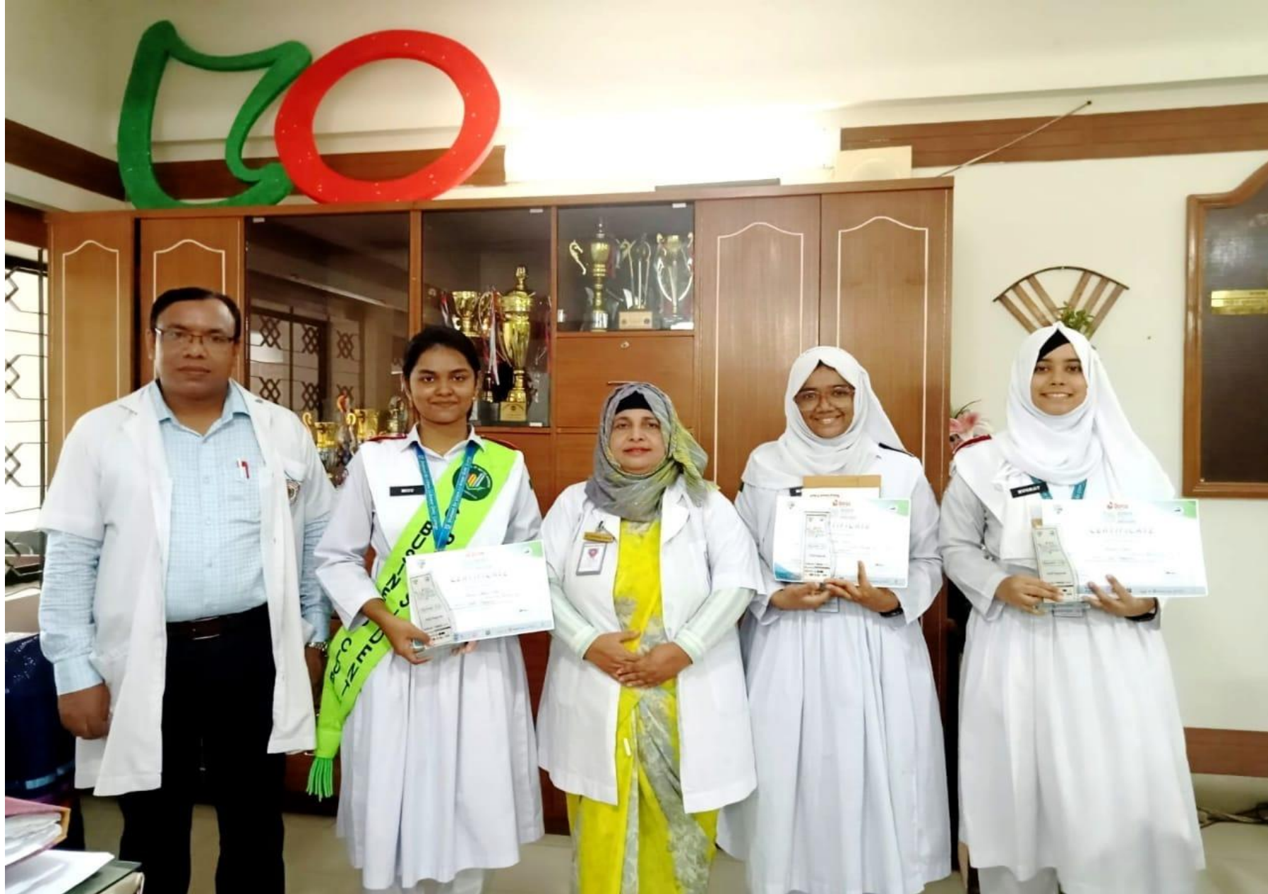
A memorable moment for our team, standing next to our Honorable Vice Principle of SAGC with one of our greatest achievements.